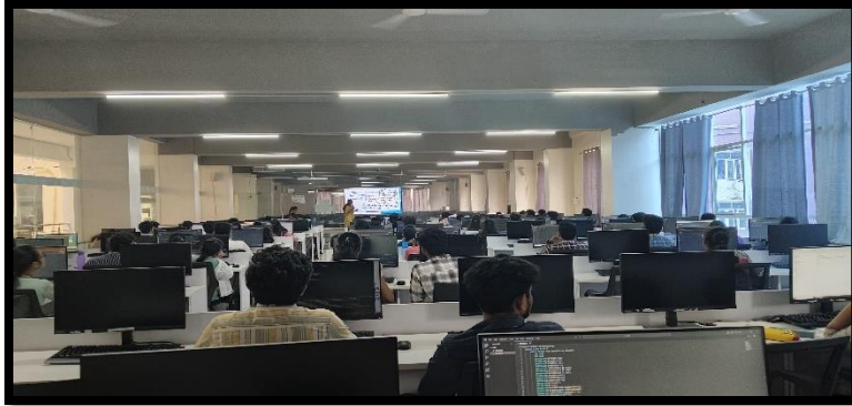
07-12-2024, 1:20 PM – 3:50 PM (CSE: Room No. 7111)