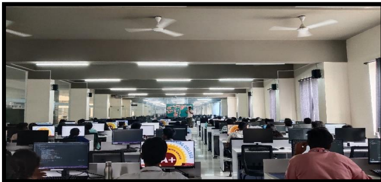
07-12-2024, 1:20 PM – 3:50 PM (CSE: Room No. 7112)