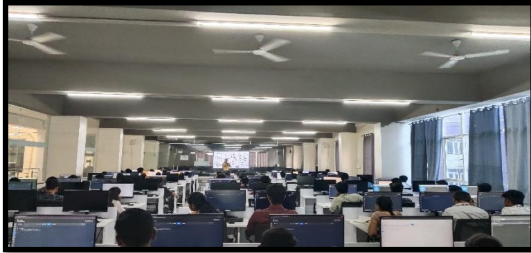
07-12-2024, 10:10 AM – 12:40 PM (ECE: Room No.7111)