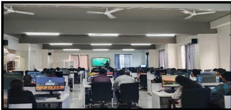
07-12-2024, 1:20 PM – 3:50 PM (CSE: Room No. 7311)